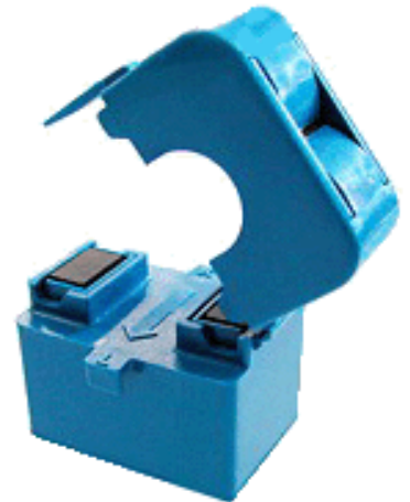
SXD Clip-on Series