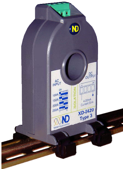
XD Ring Series

The easiest and simplest devices for measuring current